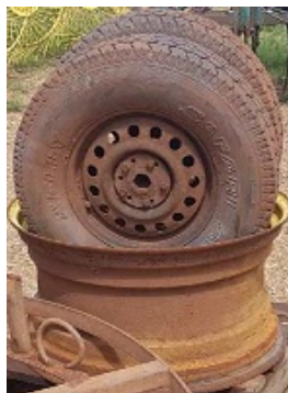
Item: TM028 - Tyres and Rims