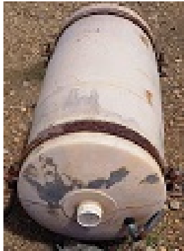
Item: TM023 - Tank