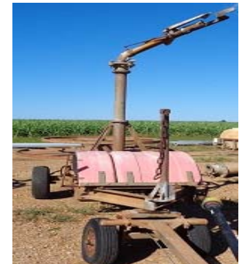
Item: 2963 - Avoka with Hose Reel and Fast Return Gun