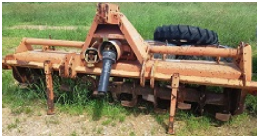
Item: 1482 - Howard HR40 Rotary Hoe