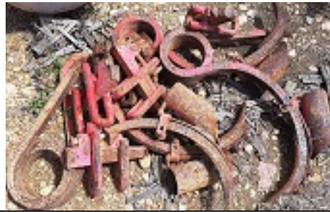
Item: TM020 - Cultivation Accessories