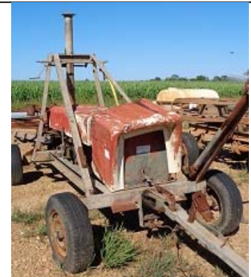
Item: TM002 - Pope with Hose Reel without Gun