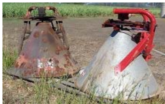
Item: TM011 - Two Fertiliser Spreaders