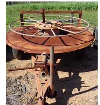
Item: 1601 - Hose Reel Trailer 2