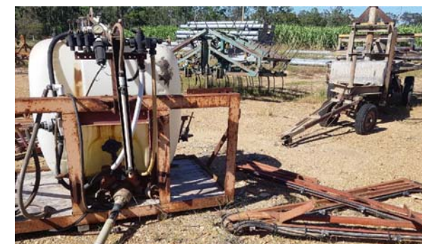
Item: TM014 - White Hardi Spray Tank for 3 Point Linkage Sprayer