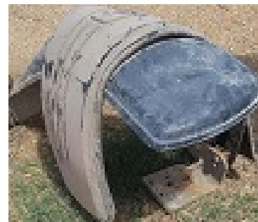
Item: TM030 - John Deere Tractor Mud Guards