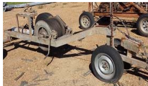
Item: TM005 - Southern Cross without Gun 2