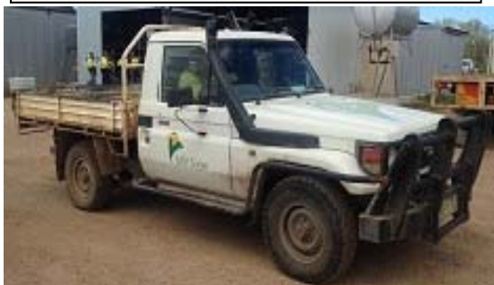
Item: 2954 - Toyota Landcruiser 4x4 Ute