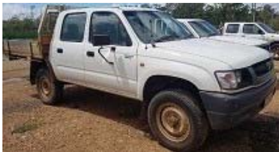
Item: 275 - Toyota Hilux Dual Cab 4x4