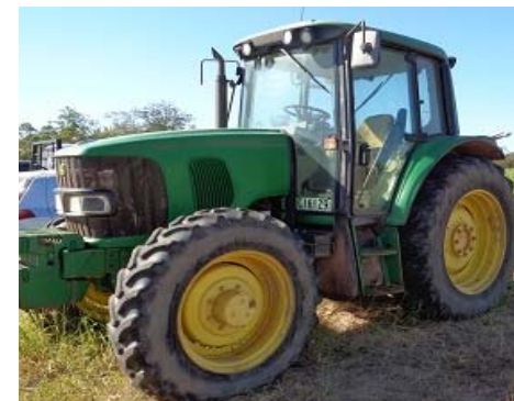
Item: 2950 - John Deere 6320