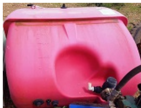
Item: TM016 - 800L Silvan Spray Tank