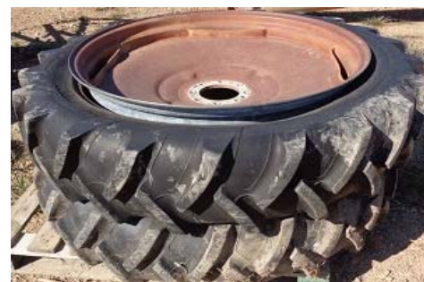
Item: TM009 - Pivot Tyres