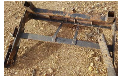
Item: TM031 - Tow Ball and Bracket