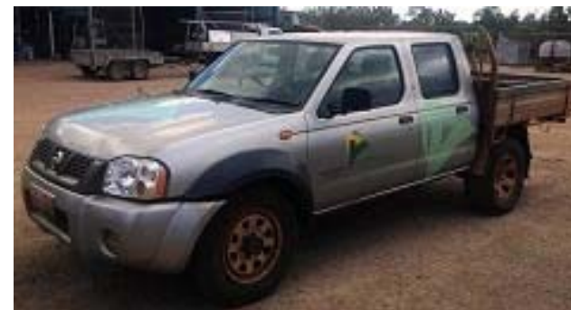
Item: 1424 - Nissan Navara Dual Cab 4x4