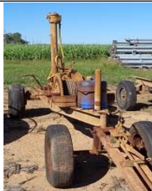
Item: TM004 - Southern Cross without Gun 1