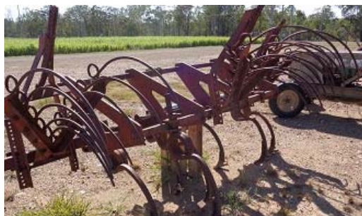
Item: TM007 - Two Row Scarifier 1