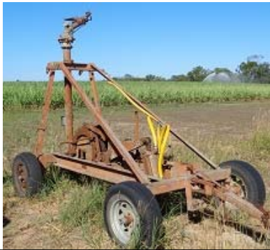
Item: 1609 - Trailco T400 with Fast Return Gun