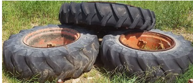
Item: TM024 - Rims and Tyres