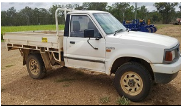
Item: 1421 - Ford Courier 4x4