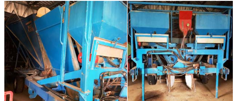
Item: 1496 - Grizzly Dual Billet Planter