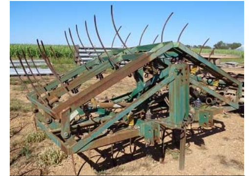
Item: 1471 - Multi Weeder