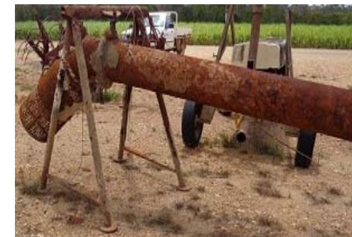
Item: TM010- Suction Pipe