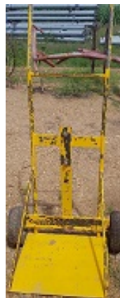
Item: TM029 - Trolley