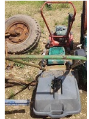
Item: TM026 - Two Lawn Mowers