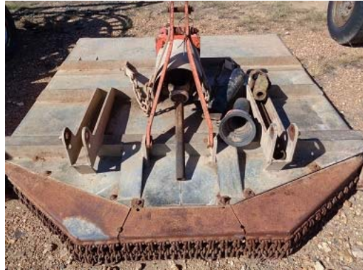
Item: 1466 - 6FT Slasher Howard