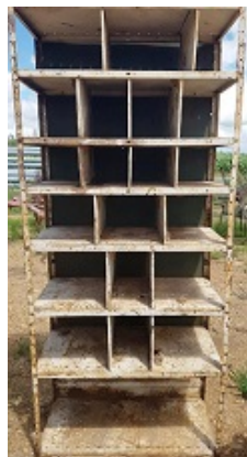
Item: TM027 - Shelving