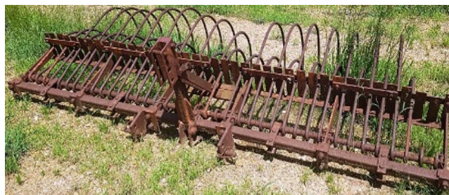
Item: 1443 - Rake