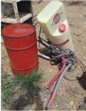
Item: 1465 - Hardi Foam Marker Tank