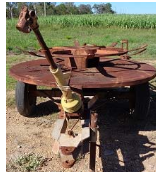
Item: 1594 - Hose Reel Trailer 1