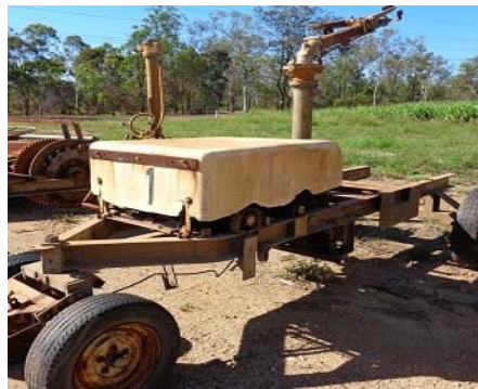
Item: 2968 - Avoka with Fast Return Gun