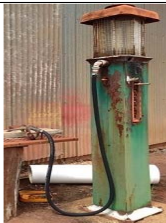
Item: TM012 - Fuel Pump