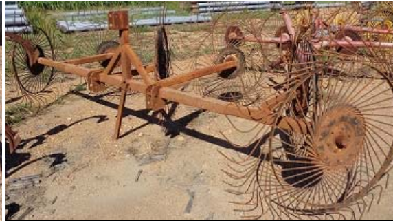
Item: 1467 - Three Row Stool Rake