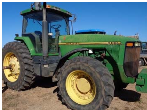
Item: 1907 - John Deere 8100