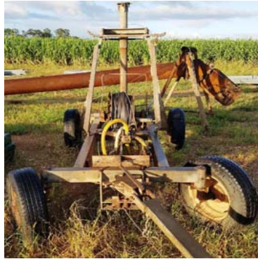
Item: 1757 - Trailco T400 without Gun