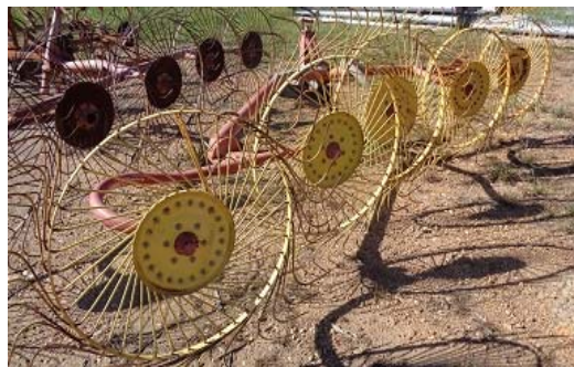
Item: 1531 - Trash Rake 1