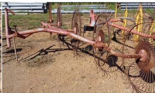
Item: 1532 - Trash Rake 2