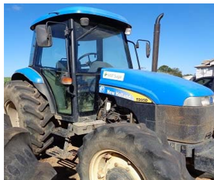
Item: 1912 - New Holland