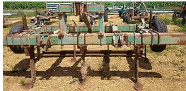
Item: 1483 - Ripper