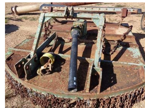
Item: 1454 - 7 FT Slasher Howard