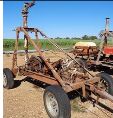
Item: TM001 - Pope with Fast Return Gun