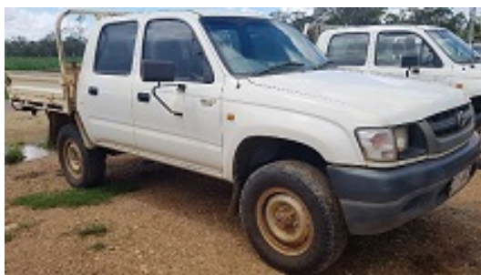
Item: 1425 - Toyota Hilux Dual Cab 4x4