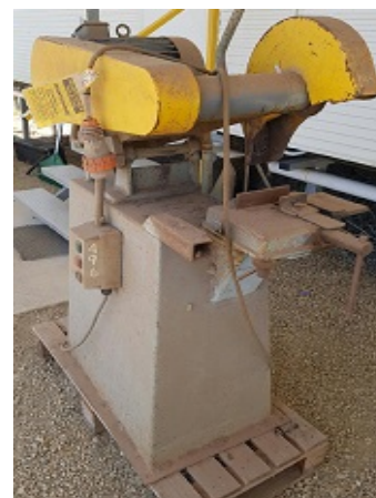
Item: TM013 - 3 Phase Drop Saw