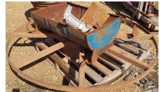
Item: TM006 - Old Irrigation Reel