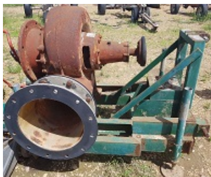
Item: TM015 - China Pump