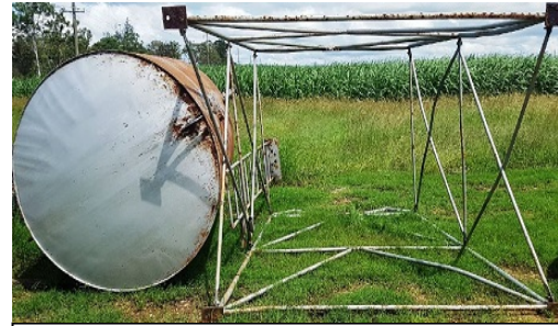
Item: TM021 - Above Ground Diesel Fuel Tank