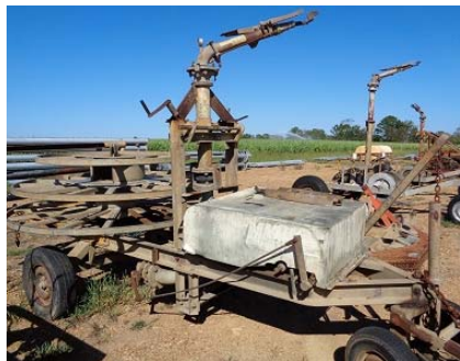
Item: 2966 - Avoka with Double Hose Reel and Fast Return Gun