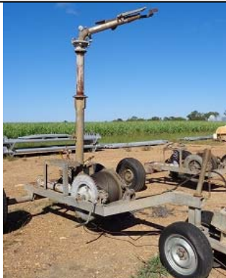
Item: TM003 - Southern Cross with Fast Return Gun