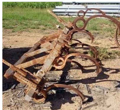
Item: TM008 - Two Row Scarifier 2