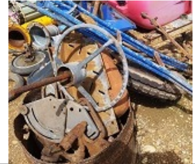
Item: TM022 - Assorted Items - Ladder and Contents of Drum