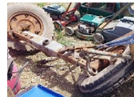
Item: TM018 - Front Axle & Wheels for Massey Ferguson 165