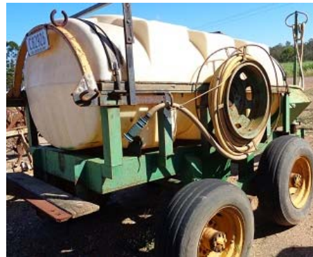
Item: 2953 - Mobile Fire Cart