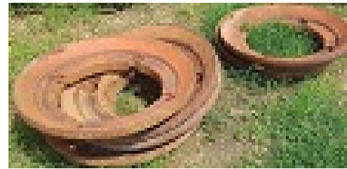
Item: TM025 - Split Rims