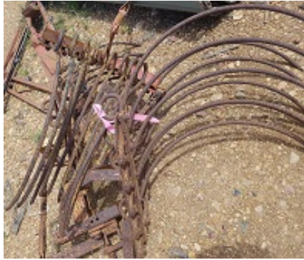
Item: TM019 - Cultivation Rakes